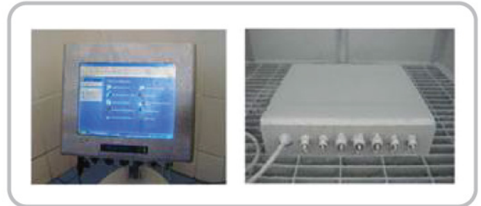
□ WTP-8865 passes IP65 water & dust proof tests