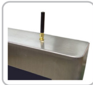
□ Water-Proof Antenna