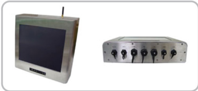
□ Waterproof connectors, membrane keypad & antenna