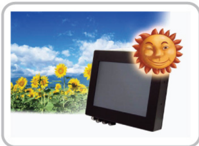
□ 1600 nits Sunlight Readable LCD