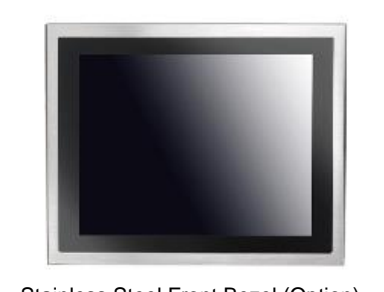
Stainless Steel Front Bezel (Option)